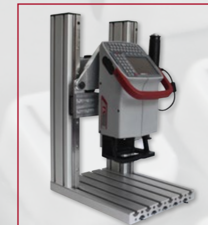
Column frame for small parts (optional)