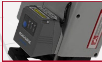
Integrated Barcode Scanner (optional)