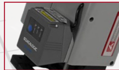
Integrated Barcode Scanner (optional)