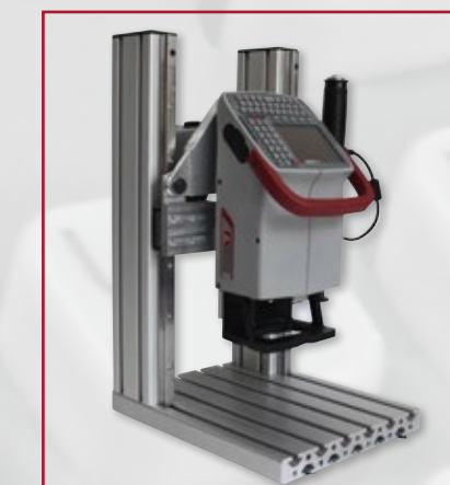
Column frame for small parts (optional)